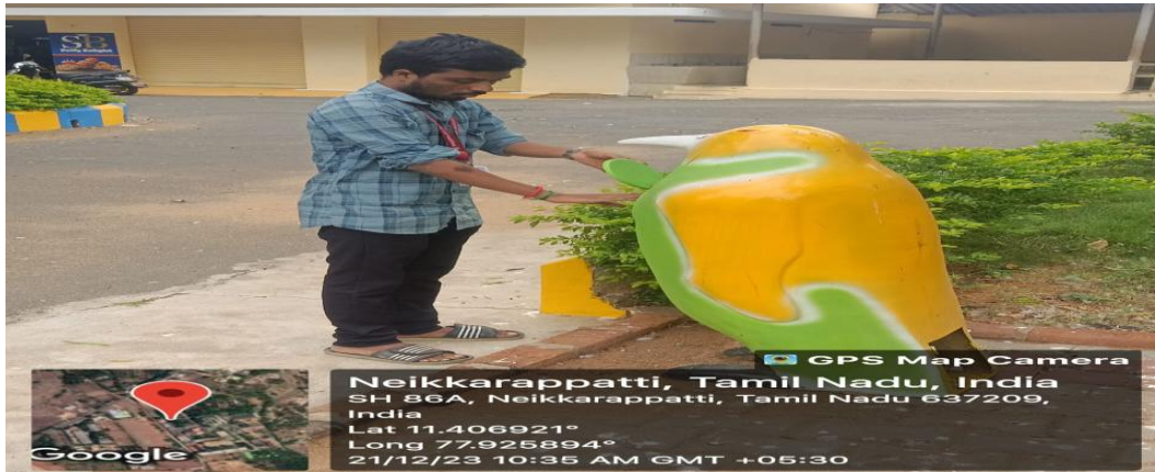
Students put dusts in dustbin