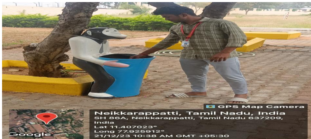
Students put dusts in dustbin