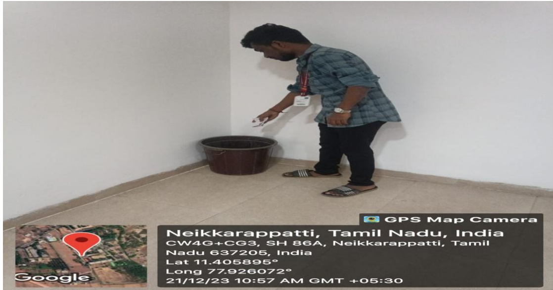
Students put dusts in dustbin at class room