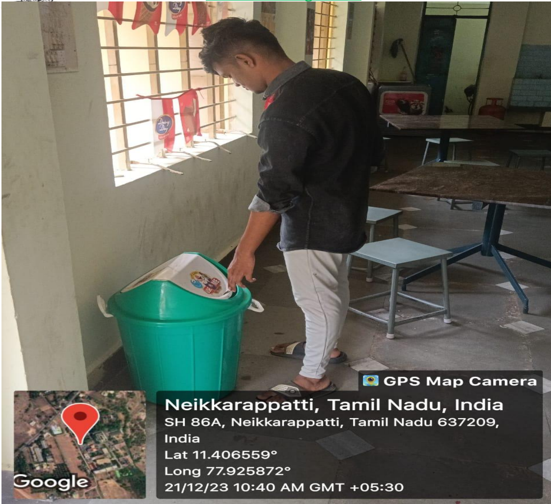
Student kept waste things in Dustbin